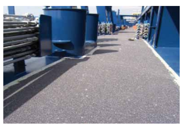
Jota Armour applied

Jota Armour is available in a limited range of colours, including Grey BS 640, and can be overcoated with a variety of topcoats.